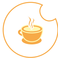
COFFEE & TEA