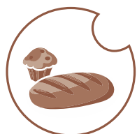
BREAD & BAKERY