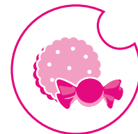
SWEETS & SNACKS

Chocolate, confectionery, biscuits and snacks